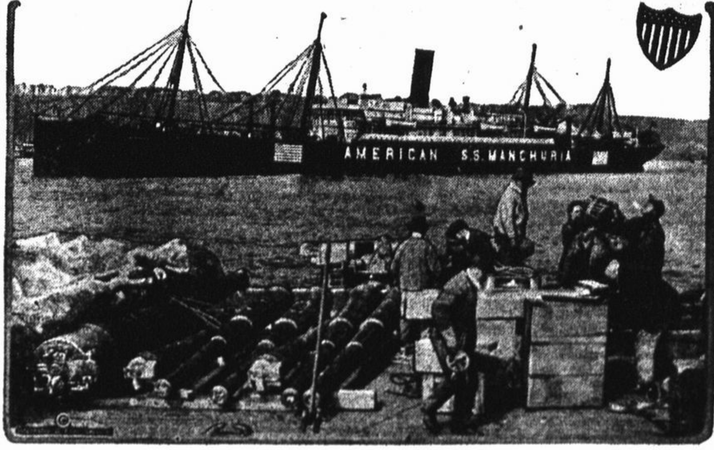
The big American freight liner Manchuria taking on guns and ammunition preparatory to sailing for Europe.