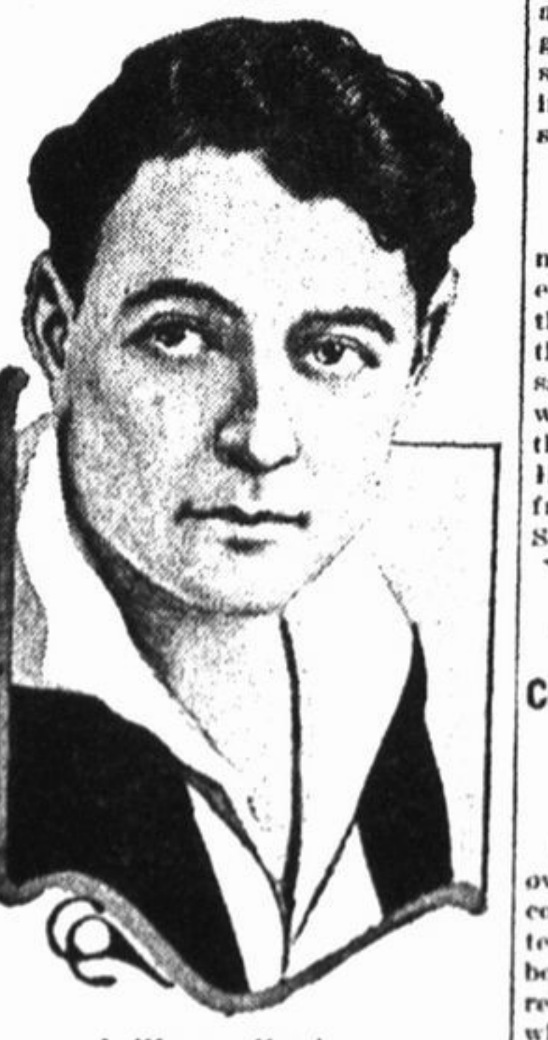
J. Warren Kerrigan. Star of screen drama who has large personal following among patrons of the movies.