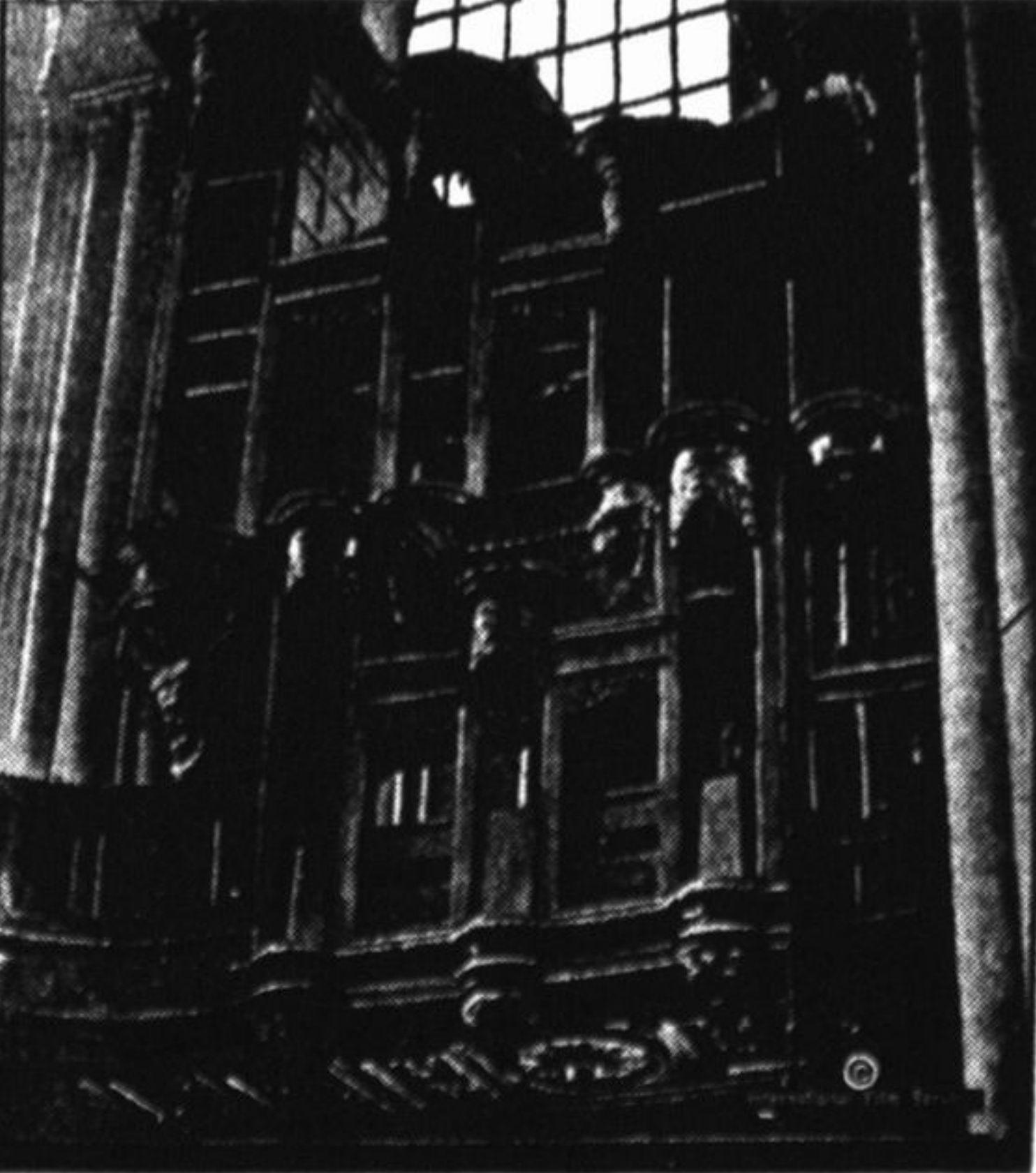
So hard pressed are the Germans for metal that as they retreated through the city of Noyon, in France, they stripped the organ in the cathedral of all the metal in its construction.