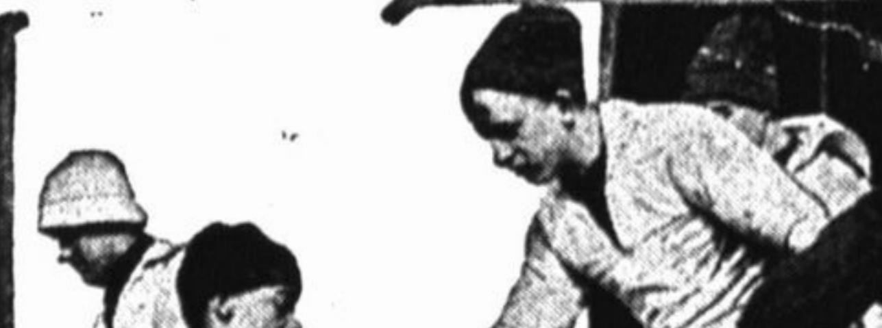
The naval collier Caesar being loaded at New York with a cargo of food-stuffs, clothing and medical supplies for Syrian relief. This is America's Christmas ship to the Armenians.