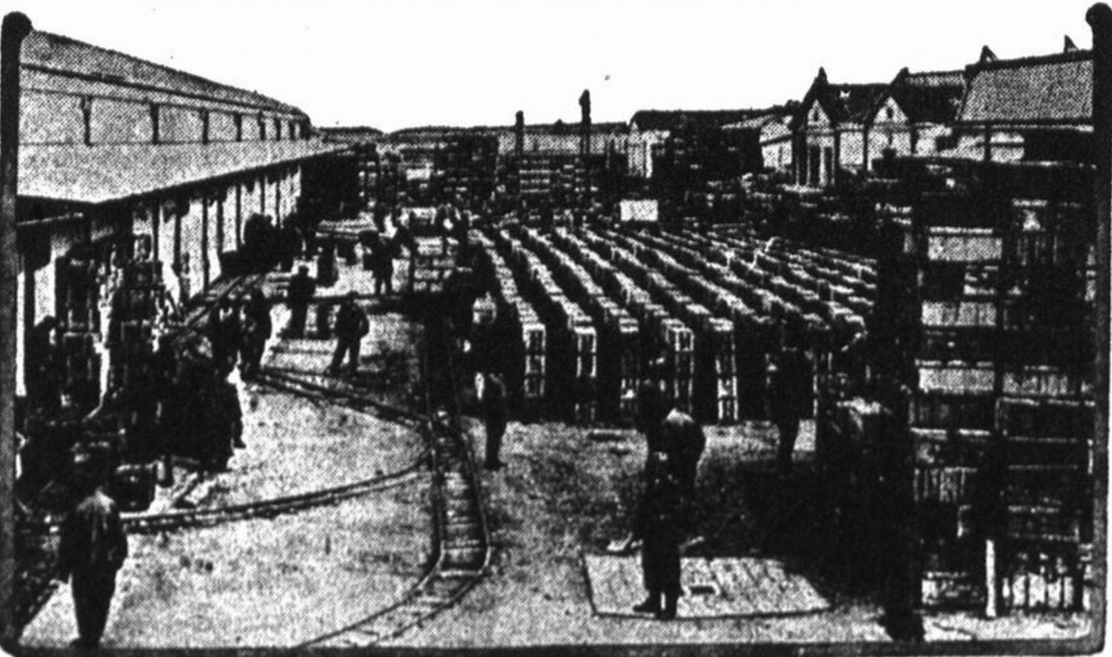
Cases full of cartridges stacked up in the yard of a big arsenal in the south of France. They are brought from the arsenal to the yard by means of a narrow-gauge railway, and when worn is received are transferred to large box cars, which roll away to the scene of operations.