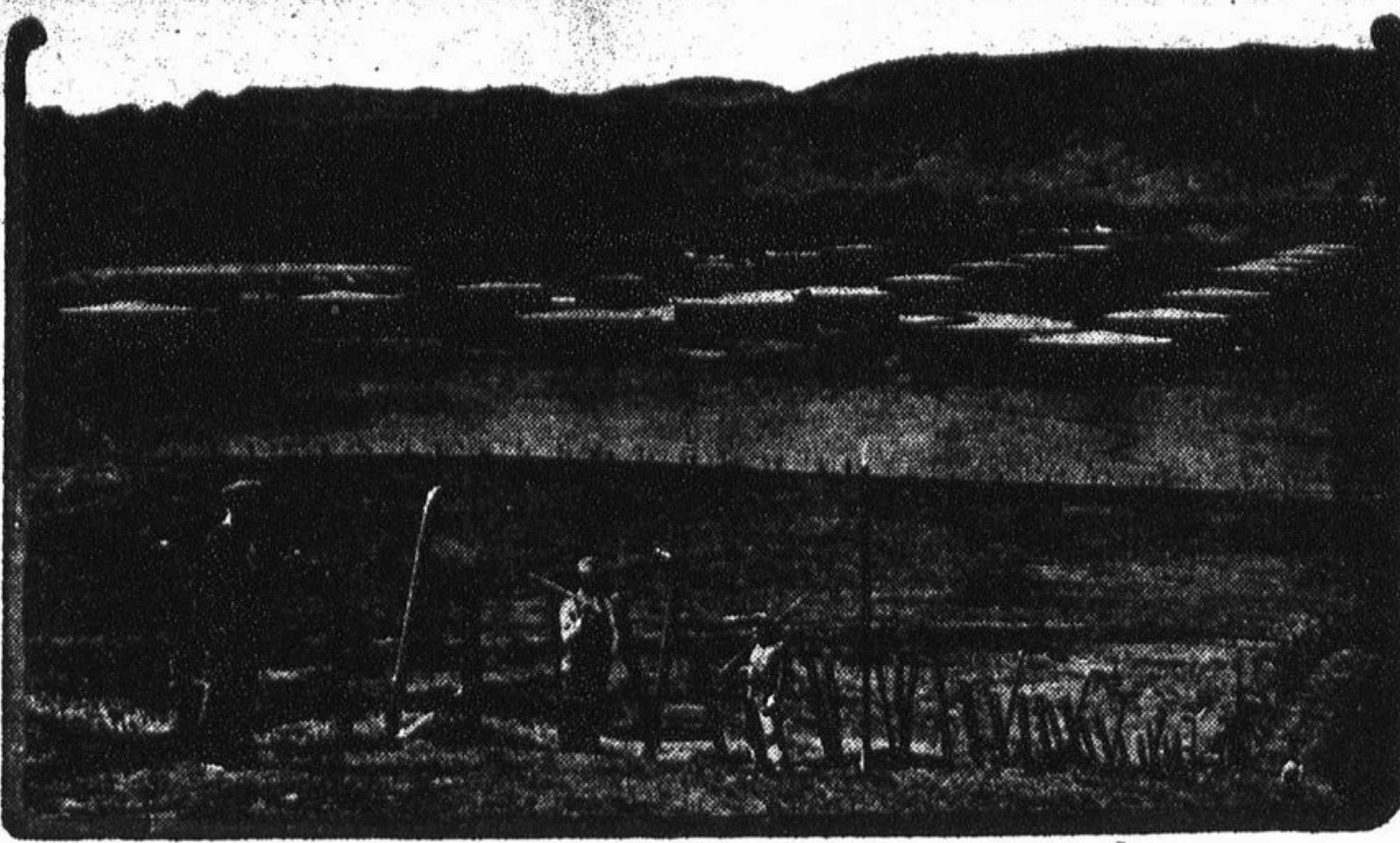
What is believed to have been an attempt to destroy the 7,000,000 barrel tank "farm" of the Producers' Transportation company at San Luis Obispo was frustrated by the guards, who exchanged many shots with the attackers. The fight took place at night just outside the nine-foot fence that is being constructed about the plant.