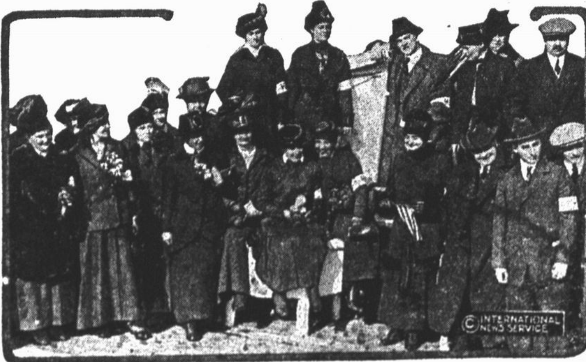
Thirty surgeons and 26 nurses, comprising the second Harvard hospital unit, sailed recently from New York for service in the war zone.