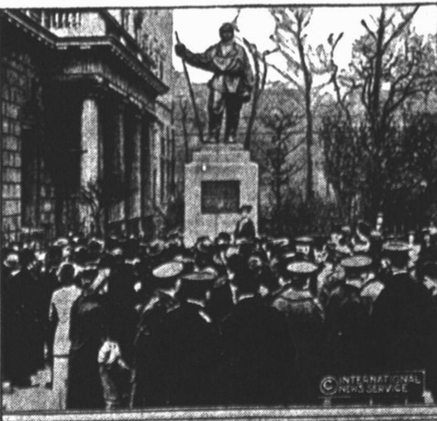
Scene during the unveiling of a monument to Captain Scott, the famous antarctic explorer, in Waterloo place, London.