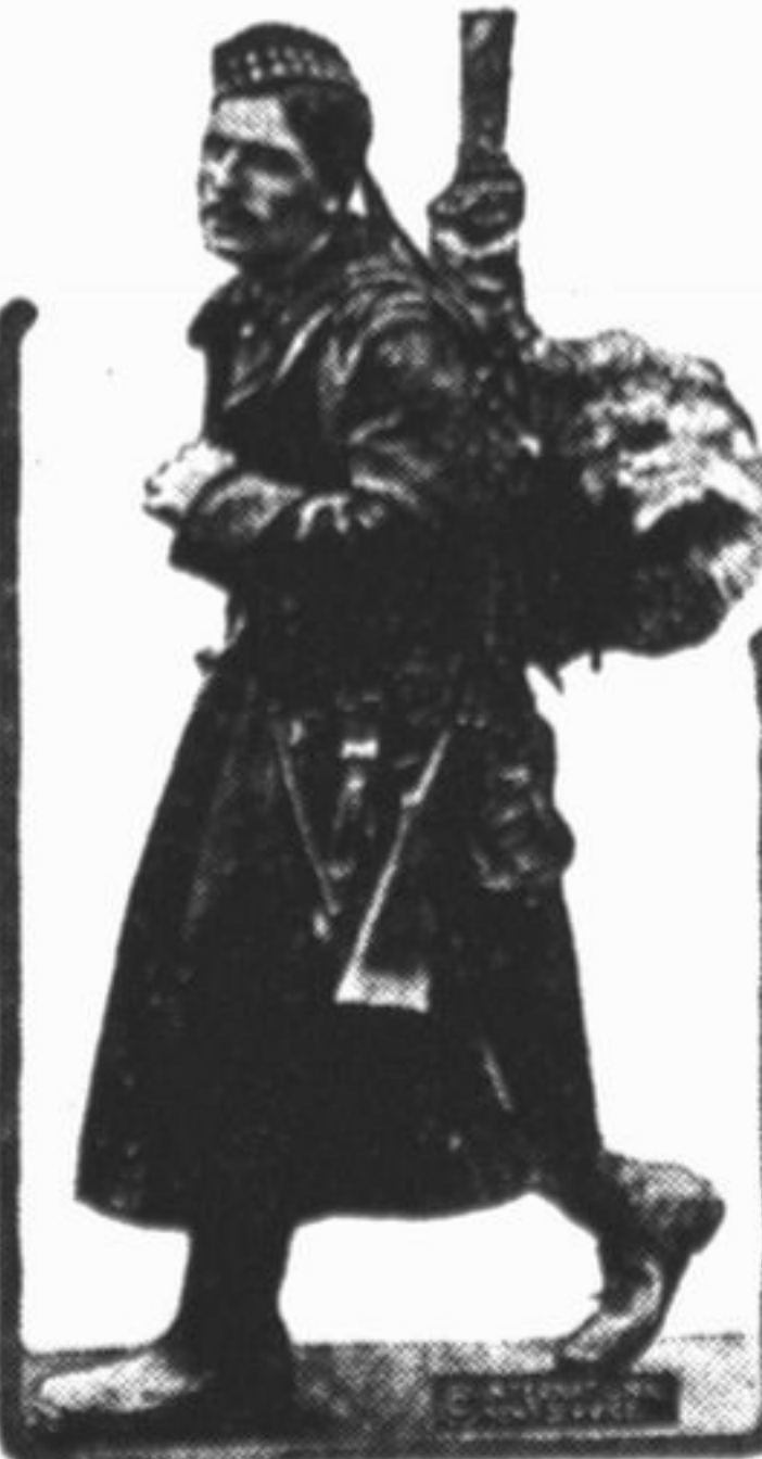
Elaborate preparations for another winter of warfare have been made by all the armies in Europe.