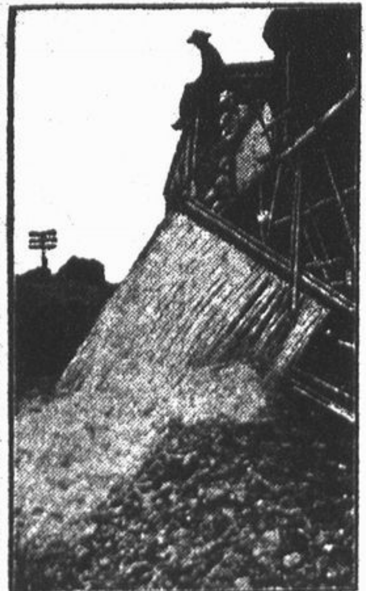
The Spray Both Kills the Weeds and Preserves the Railway Ties.

The accompanying illustration shows how certain railroad and trolley companies are resorting to mechanical sprinklers for eliminating weeds and grasses from the roadbed.