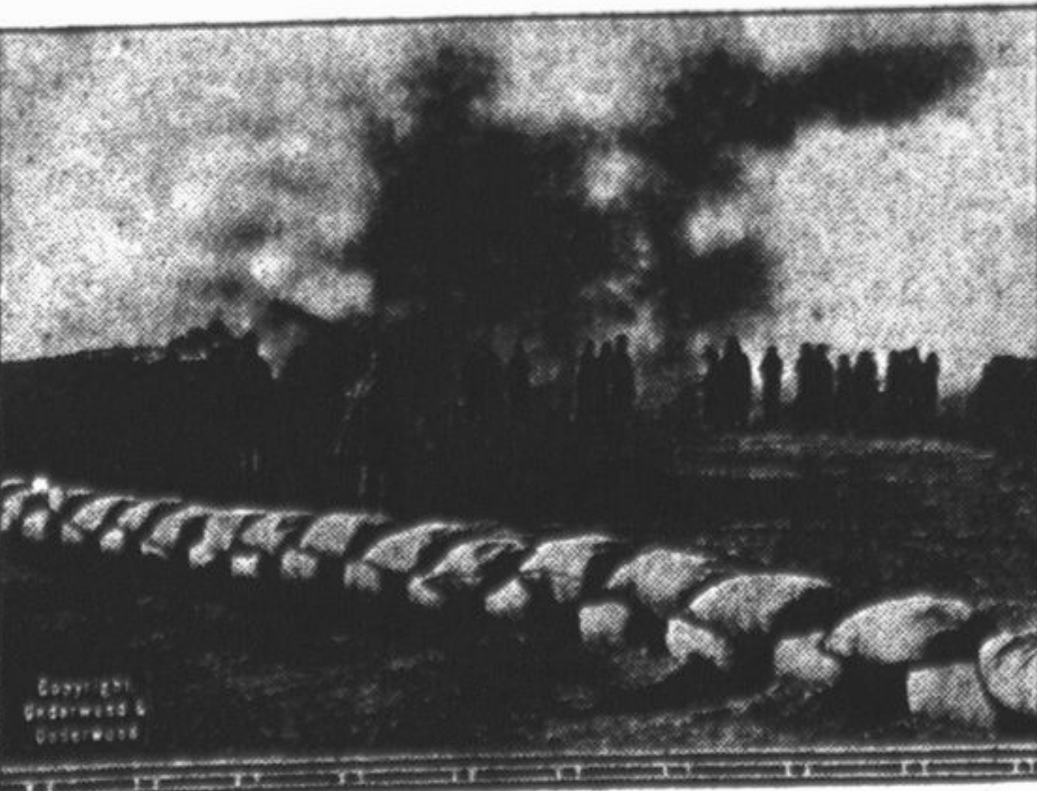
This is one of the Italian monster "149" guns located within ten miles of the Austrian fortifications of Gortiz, on the Carso plateau.