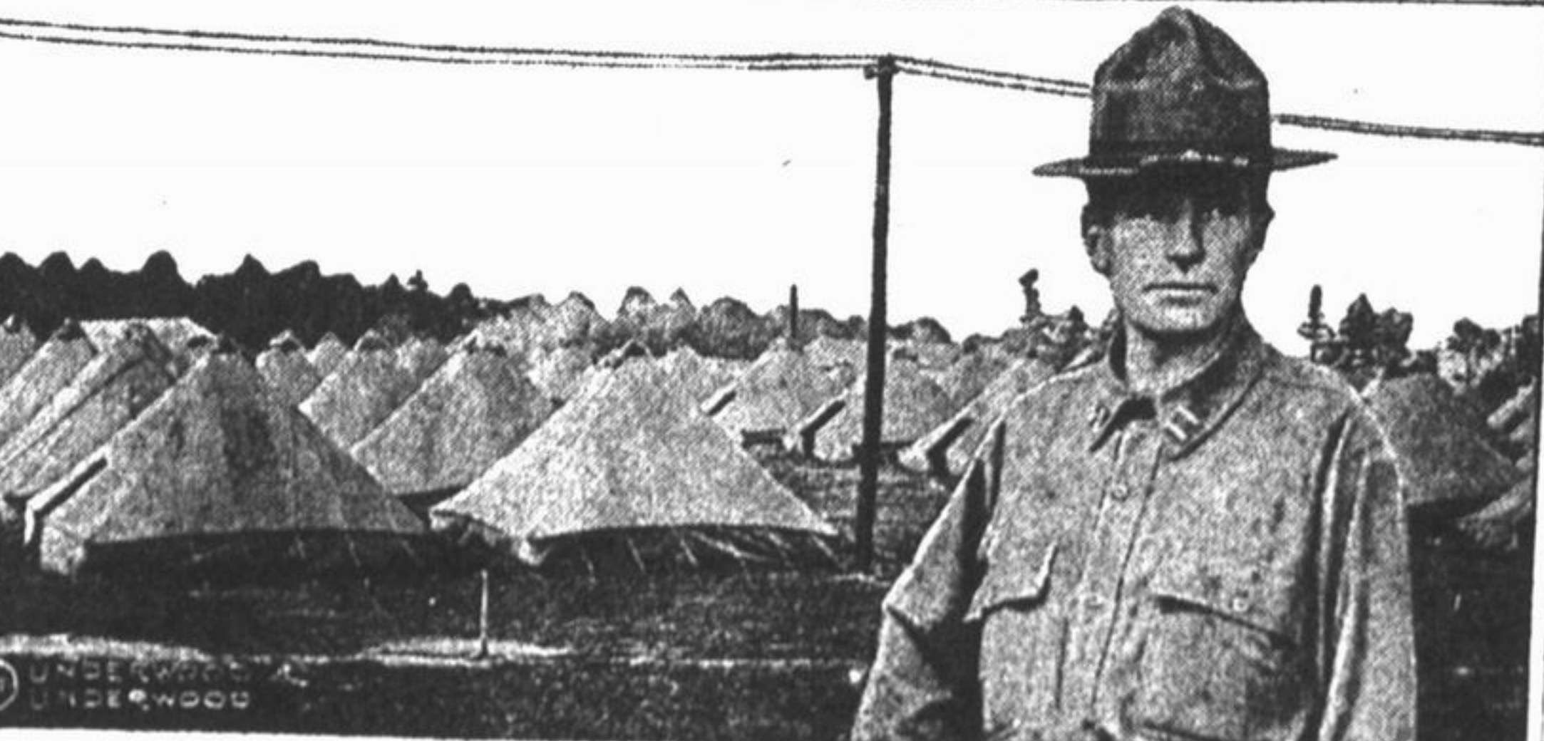
View of the camp at Plattsburgh, N. Y., where hundreds of business men from every state in the Union are receiving military training...