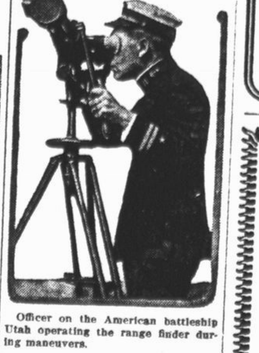
Officer on the American battleship Utah operating the range finder during maneuvers...