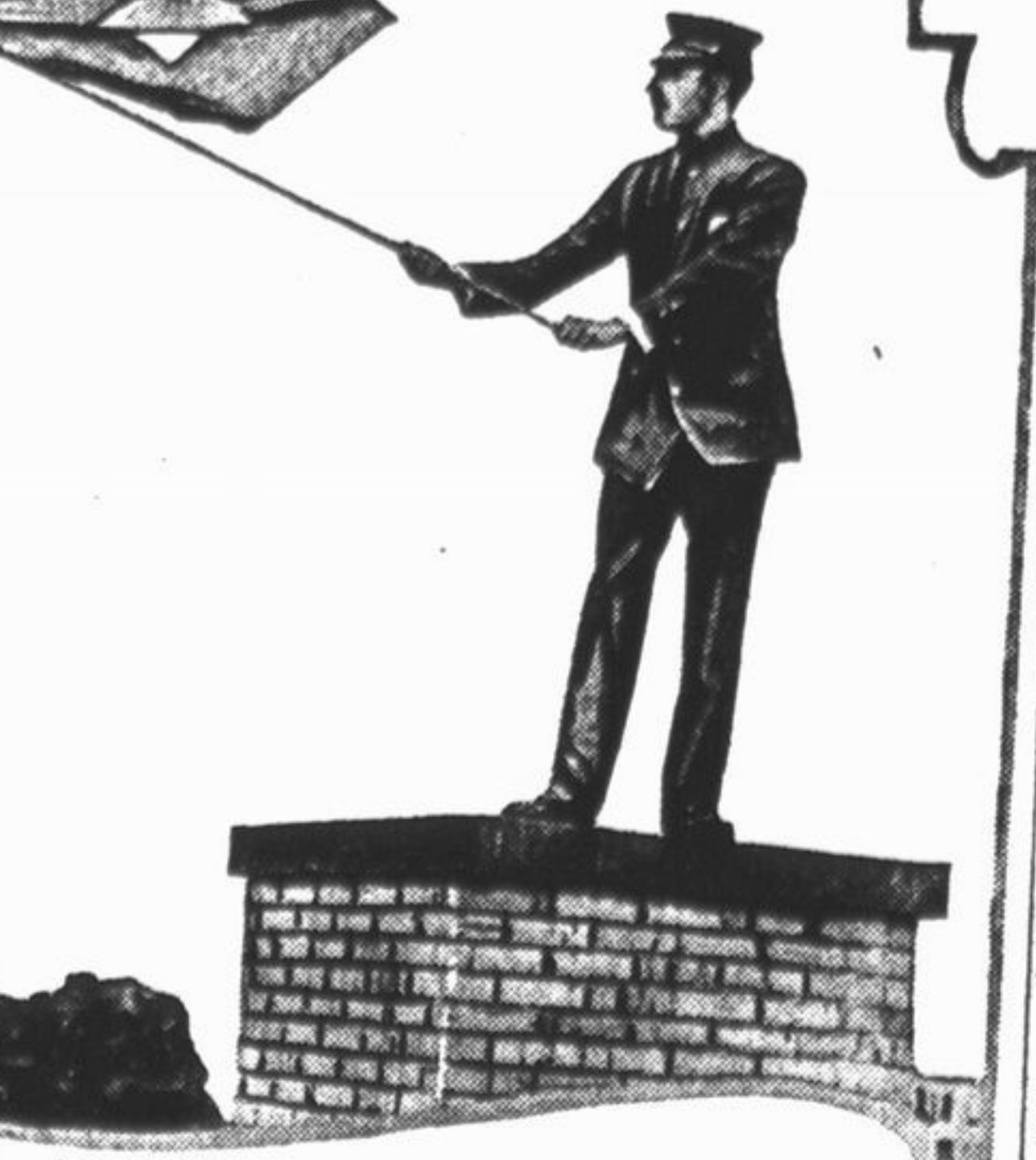
The police department of New York has a new signal corps that is being thoroughly trained...