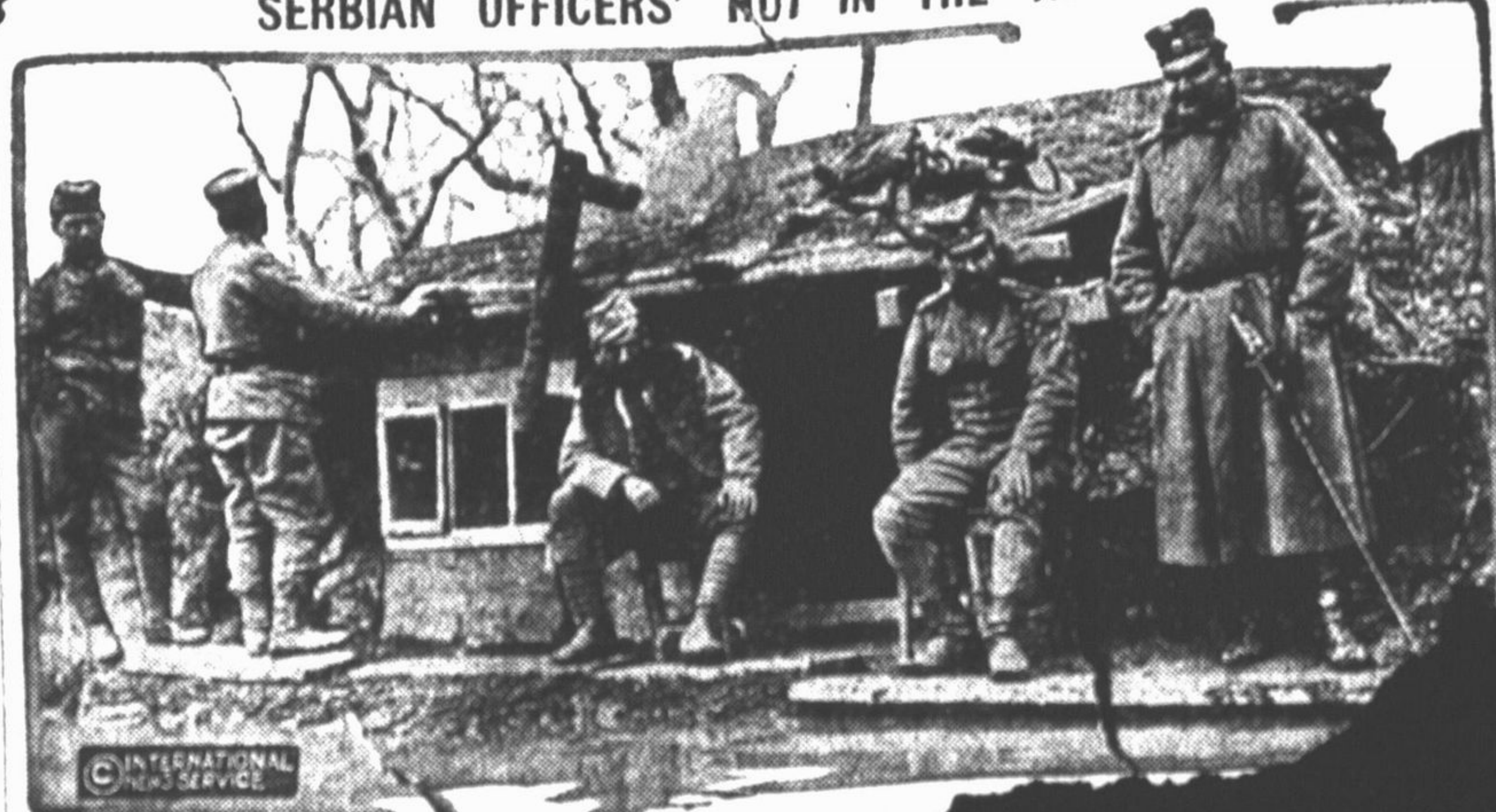
This hut for Serbian officers is behind a protecting embankment within 50 yards of the Aug. trenches.