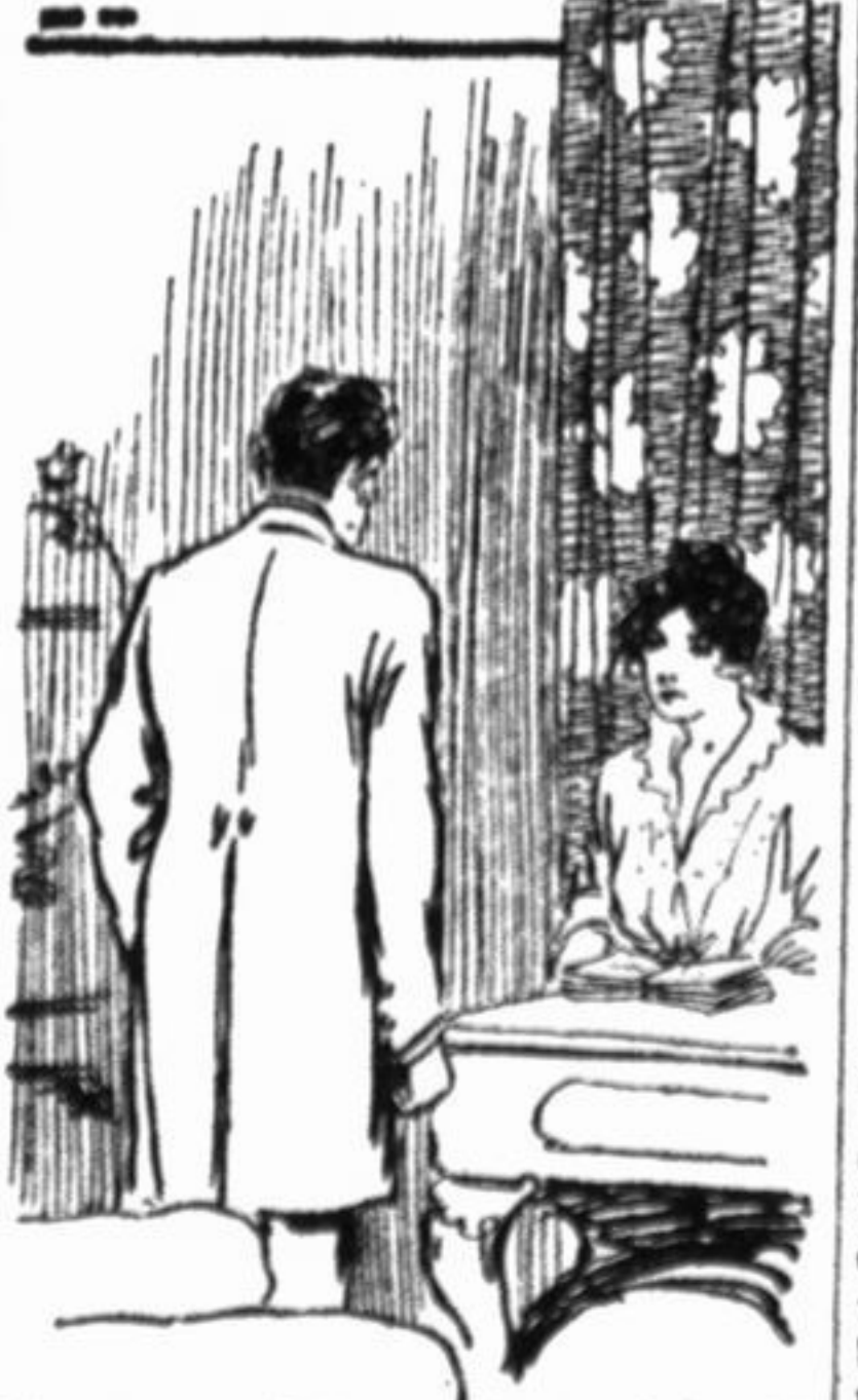
"And What Did He Think of You?"