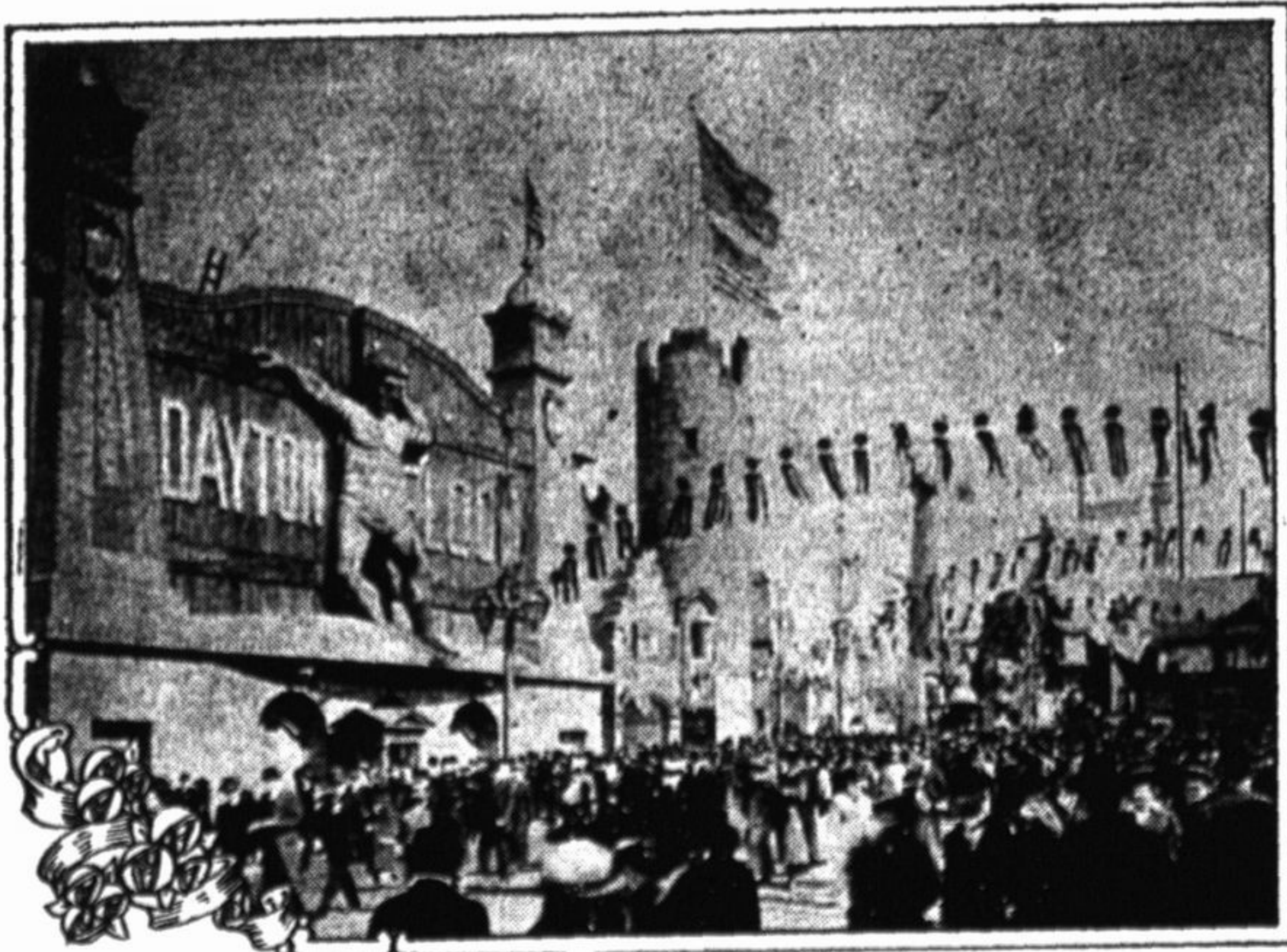
VAST crowds throng The Zone, the amusement and concessions section of the Panama-Pacific International Exposition at San Francisco. The Dayton Flood is shown on the left, the Chinese Village and Toyland Grown Up on the right. The Exposition is breaking all world's attendance records.