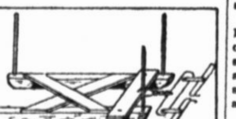
Sled for Hauling Brush.

This sketch shows a handy a device as I have ever seen for hauling brush out of an orchard. I selected a couple of straight poles ten or twelve feet long and about six inches in diameter at the large end, writes T. C. Graham of Douglas county, Kansas, in Mississippi Valley Farmer. I hewed them down, leaving them sled-runner shape at the big end. A two by six inch plank, four feet long was bolted across in front and two cross braces nailed on securely as shown in the drawing. Large holes were bored at the ends for standards. I begin loading the brush on the rear.