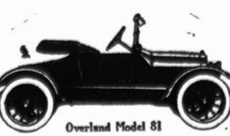
Overland Model 81

Touring Car Electric Starter, and Lighting $850