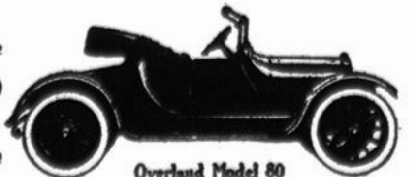
Overland Model 80

Roadster Electric Starter, and Lighting $1050.00