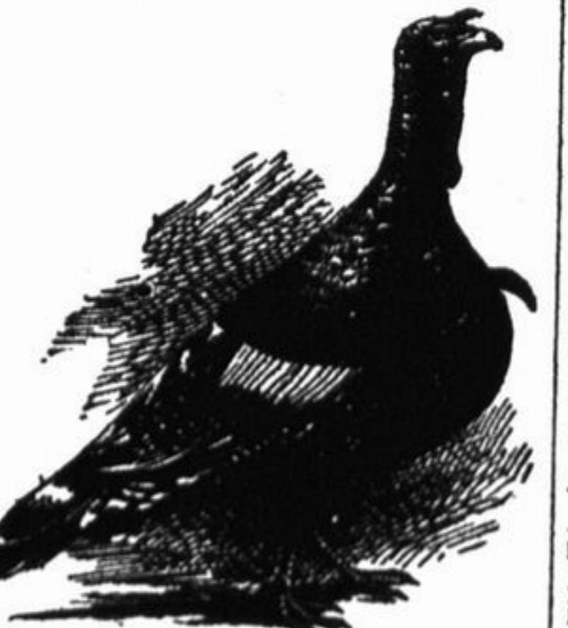
A Most Popular Bird.

After the eggs are all hatched leave the mother alone as long as she will stay in the nest. Then confine her with the poults in a coop until they have learned her call, as they will fol-