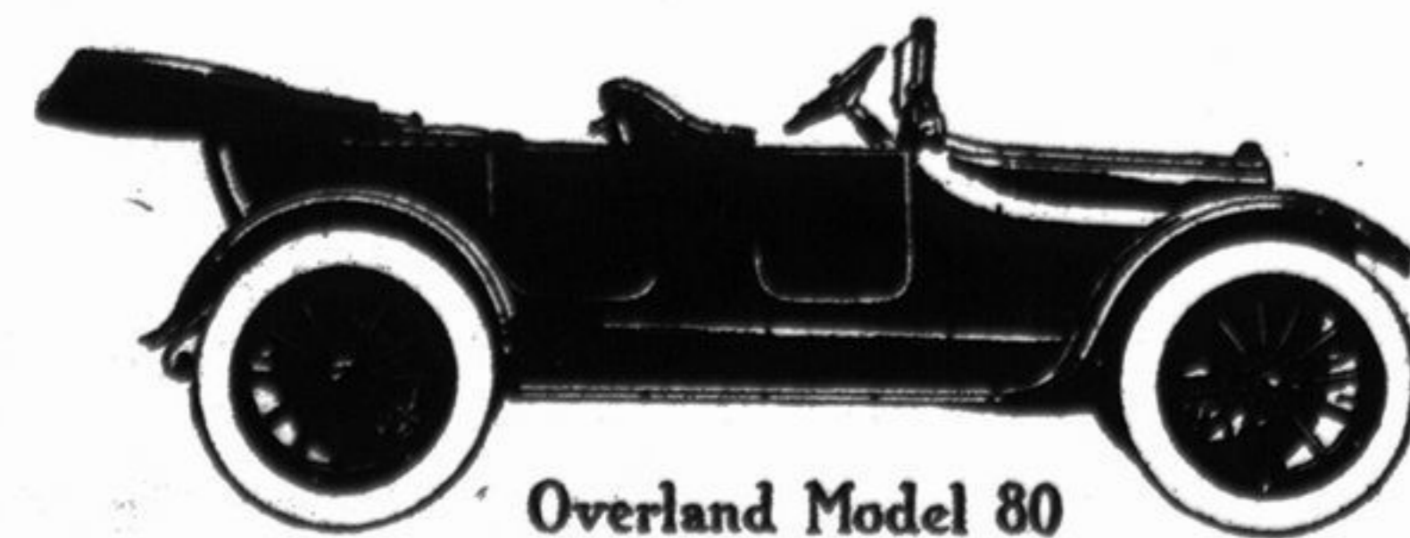
Overland Model 80