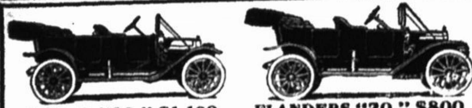
E. M. F. "30," $1,100

Factory: Corner Forest Avenue and Belmont