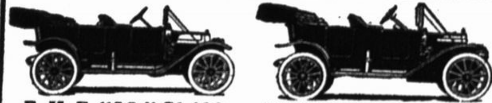
E. M. F. "30," $1,100

Factory: Corner Forest Avenue and Belmont