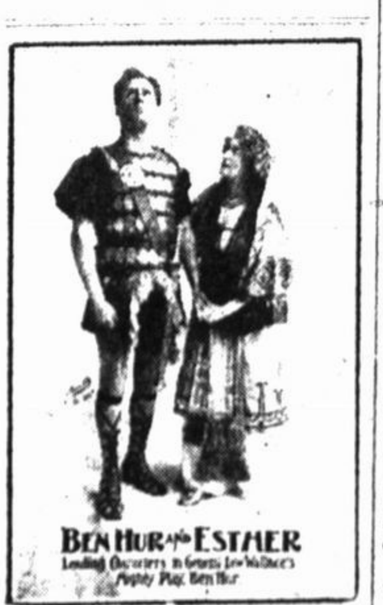
BEN-HUR OF ESTEAER

In the galleries of our memory, among the impressions of dramas we have seen, here and there, one will stand out clear-cut, while the others are dim and uncertain.