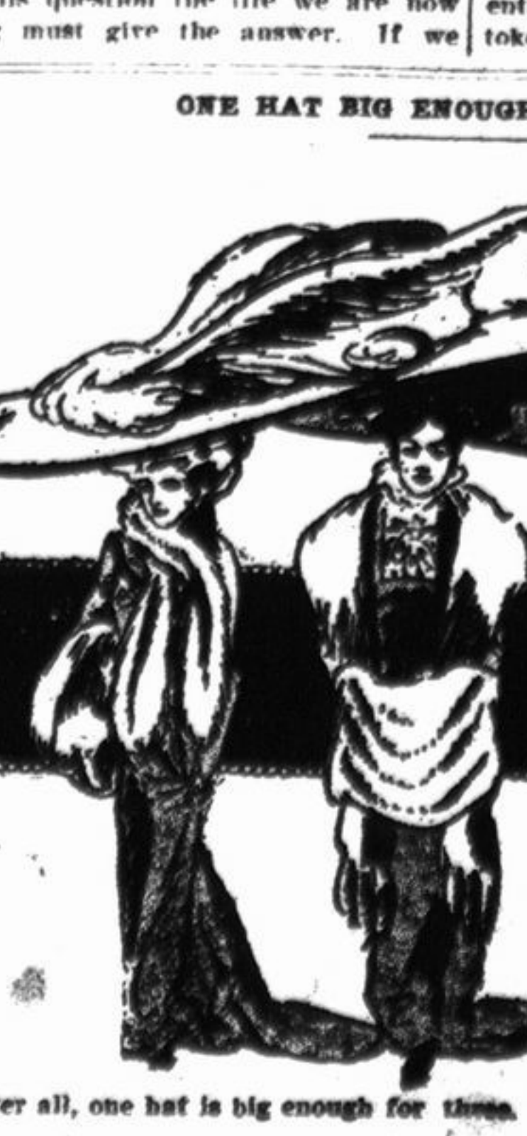
After all, one hat is big enough for three.