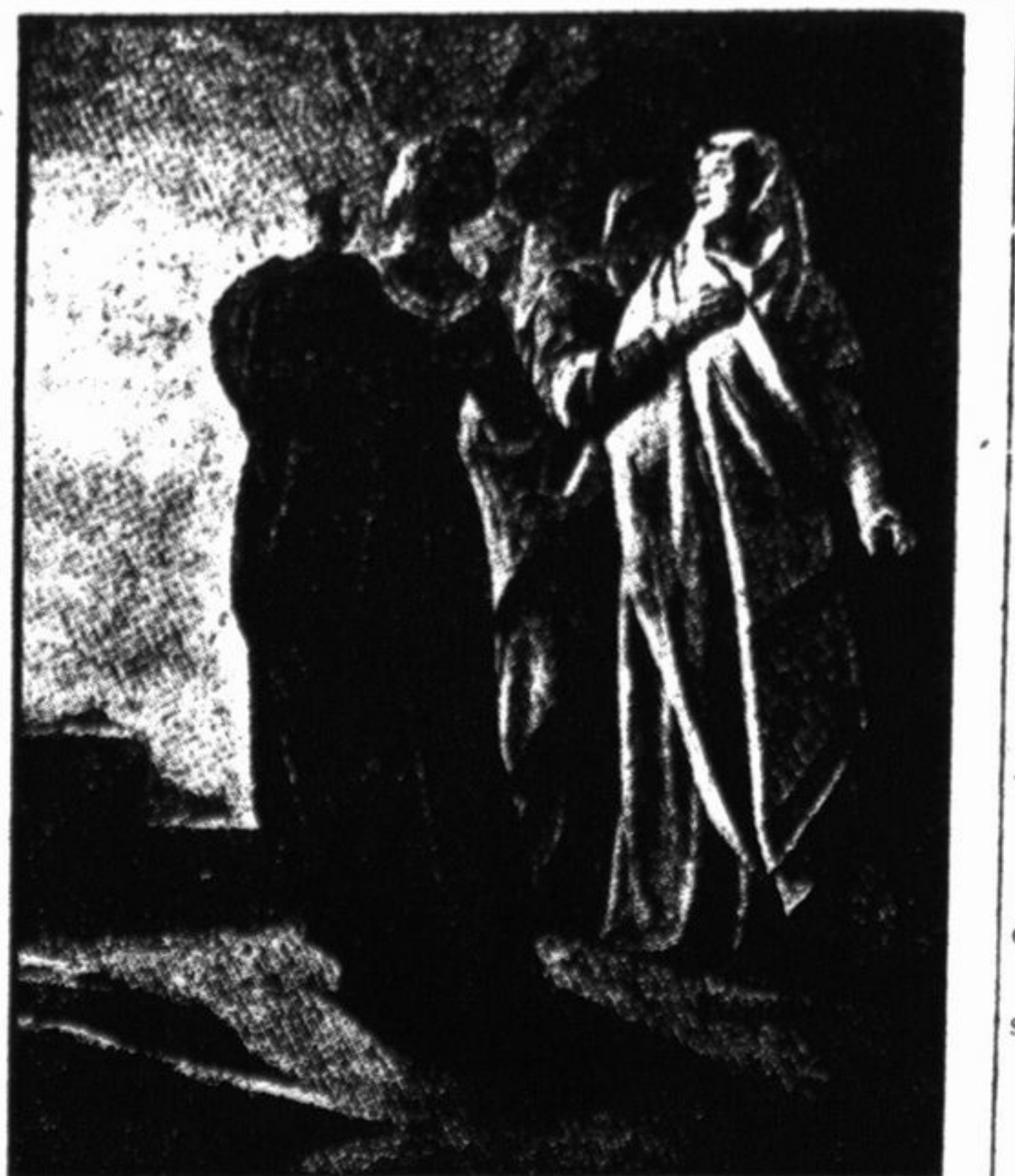
WOMEN AT THE SEPULCHRE EARLY IN THE MORNING.

A rabbit is not a hare, although they are cousins. There is one marked difference between them. The baby rabbit, as all know who keep these little animals as pets, comes into the world blind and helpless.