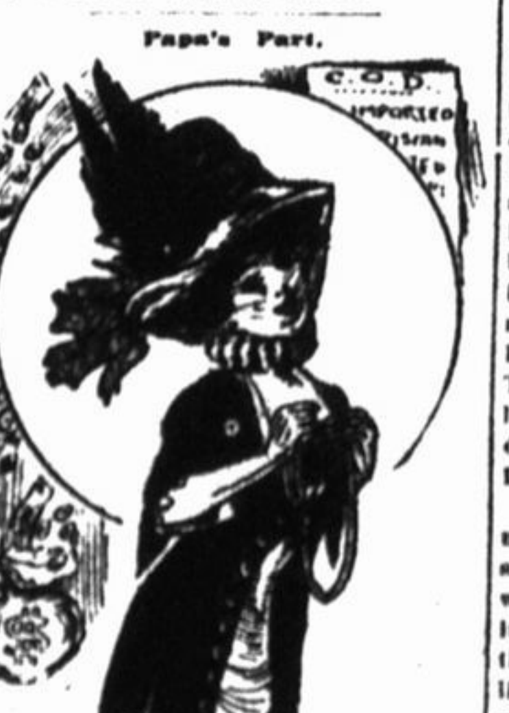
Now little Miss Pratt bought a dream of a hat, With a dear little little upon it.

Light from the Tomb. The open tomb is God's answer to the hope of the ages.