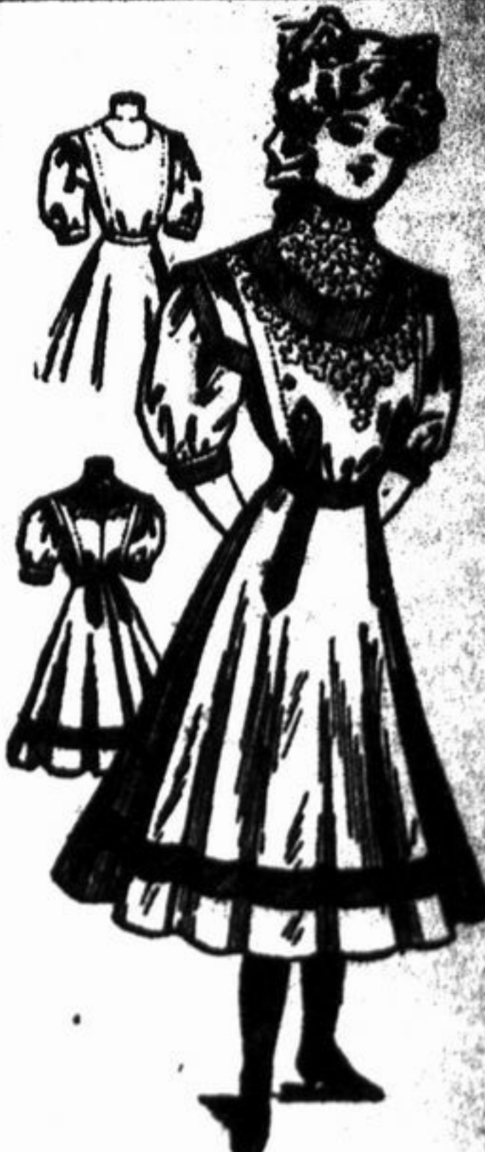
PATTERN NO. 9035

Girl's Dress with Circular Skirt... Circular skirts are exceedingly fashionable just now for the school girls as well as for their elders.