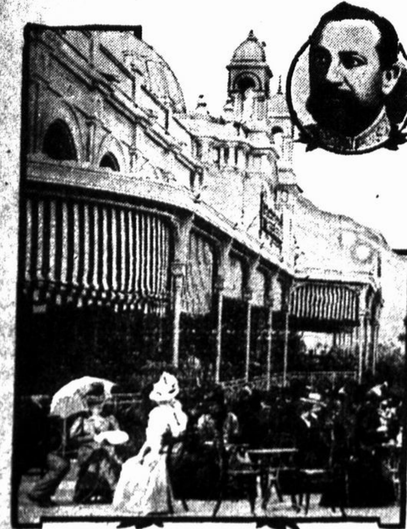
GAMBLING CASINO AT MONTE CARLO AND PRINCE OF MONACO.