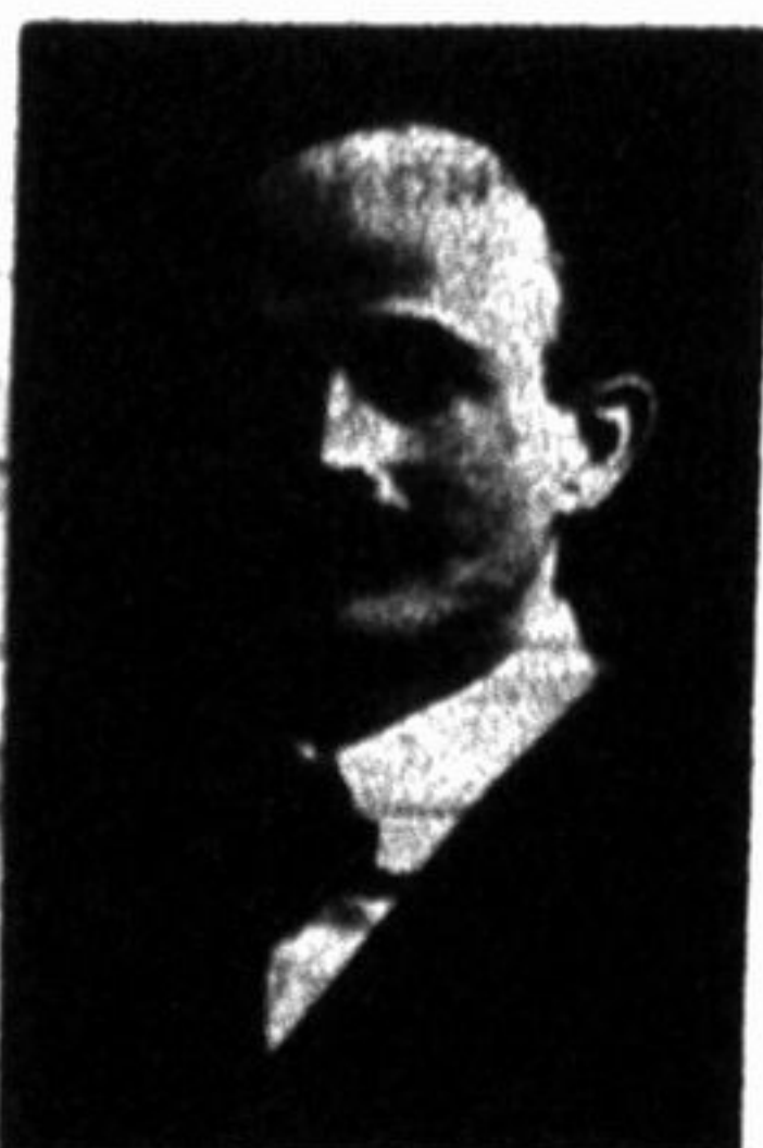
JUDGE BEN B. LINDSEY.