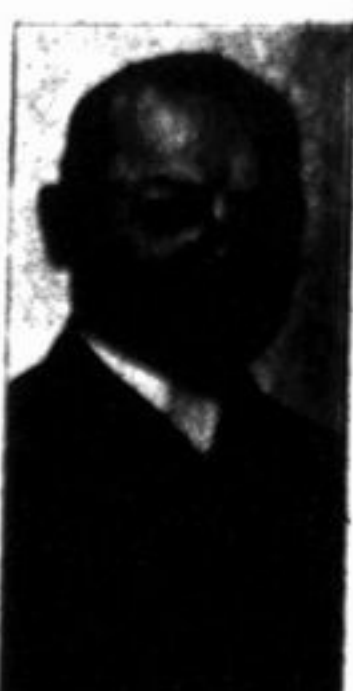
HON. WILLIAM H. STEAD.