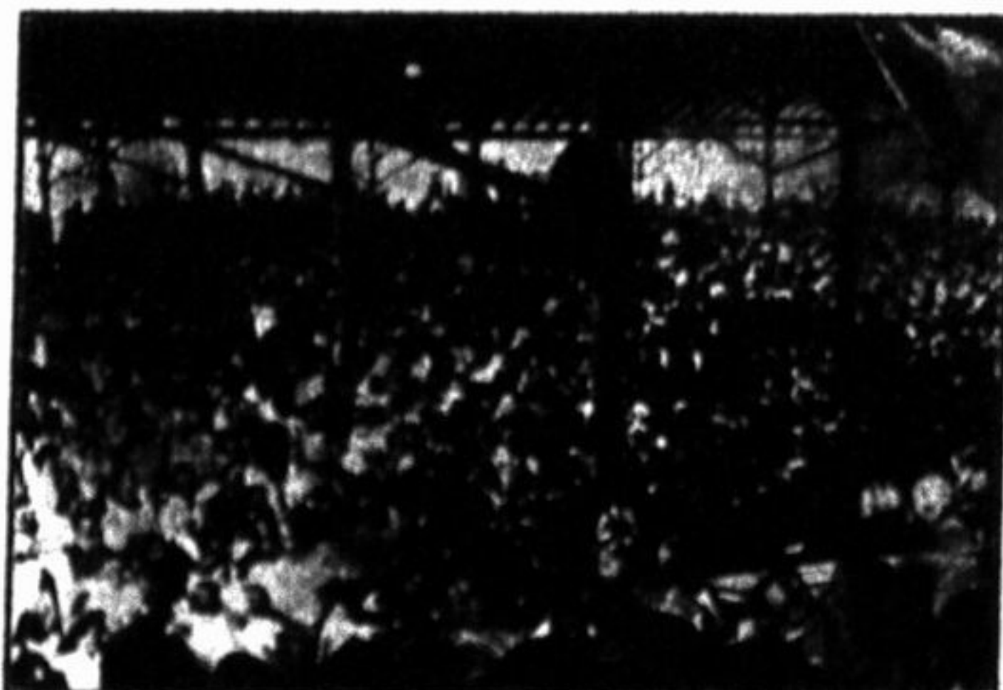
AUDITORIUM AT PETERSBURG.