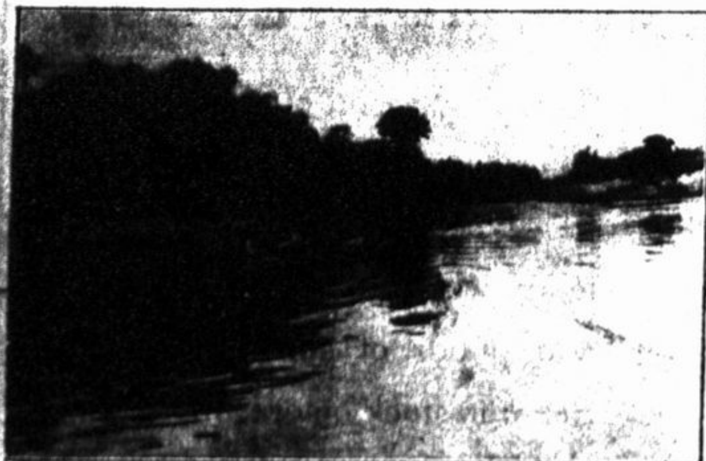
BOATING ON THE SANGAMON.