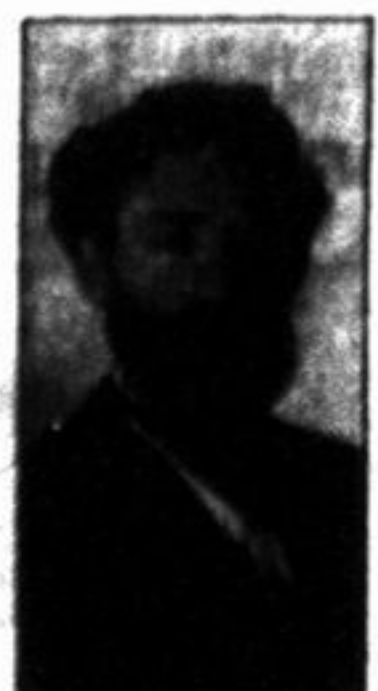
J. HAMILTON LEWIS.