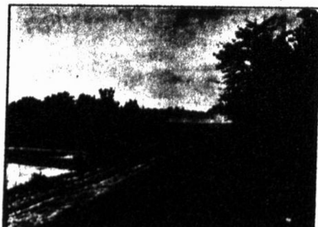
OLD SALEM MILL.