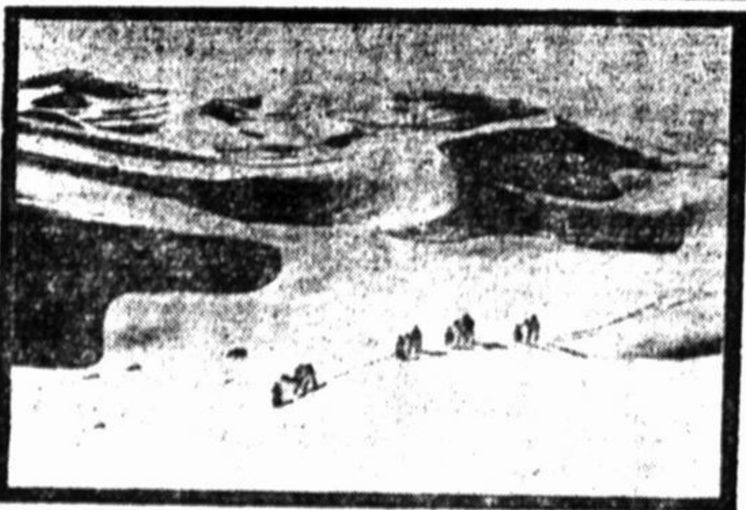
SAND WAVES OF A DESERT SEA.

Odd Habits of Pheasants. There is some curiosity as to how many English pheasants will be raised in Kansas this year. The average number of birds raised by each pair of parent birds is sixty. With 2,000 in the State this would mean about 7,000,000 birds in two years. The woods and