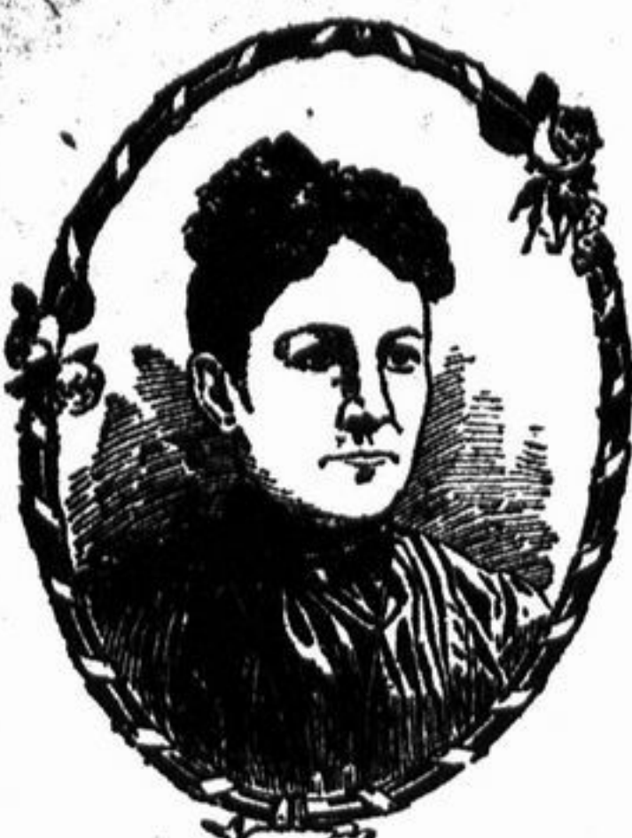
A Professional Nurse Tells Her Experience With Doan's Kidney Pills.