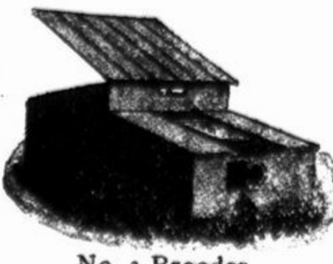
No. 3 Brooder.

The Cornell Incubators Peep O' Day Brooders