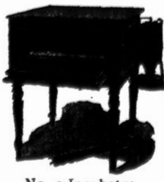
No. 1 Incubator.

T. F. POTTER & CO., Maple St., Downers Grove, Ill.