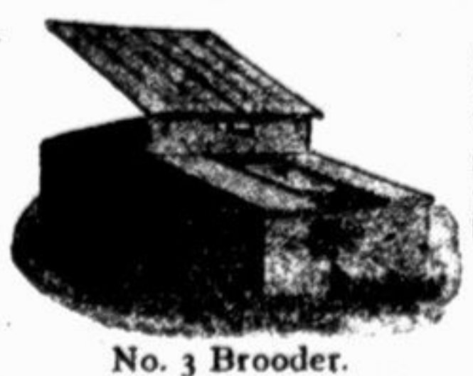
No. 3 Brooder.

Are the recognized standards of today for the artificial hatching and rearing of chicks. We are introducing these goods here at reduced prices. Call on us and get our prices and inspect our stock of incubators brooders and