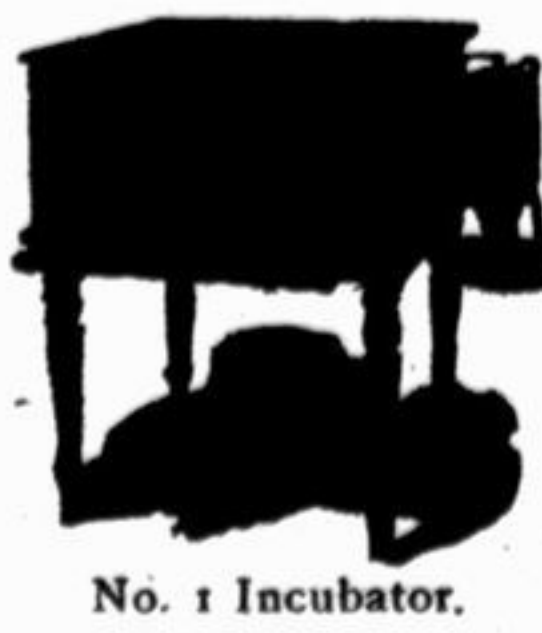
No. 1 Incubator.