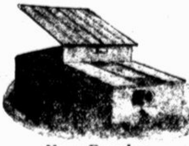
No. 3 Brooder.

Are the recognized standards of today for the artificial hatching and rearing of chicks. We are introducing these goods here at reduced prices. Call on us and get our prices and inspect our stock of incubators brooders and