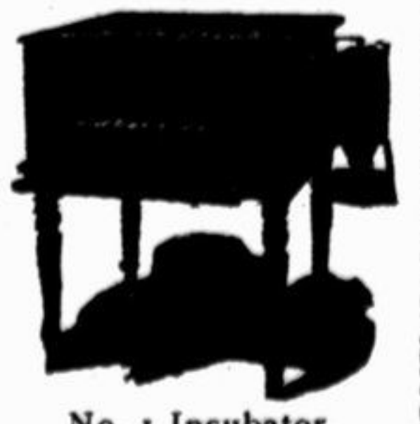
No. 1 Incubator.

T. F. POTTER & CO., Maple Ave. Downers Grove, Ill.