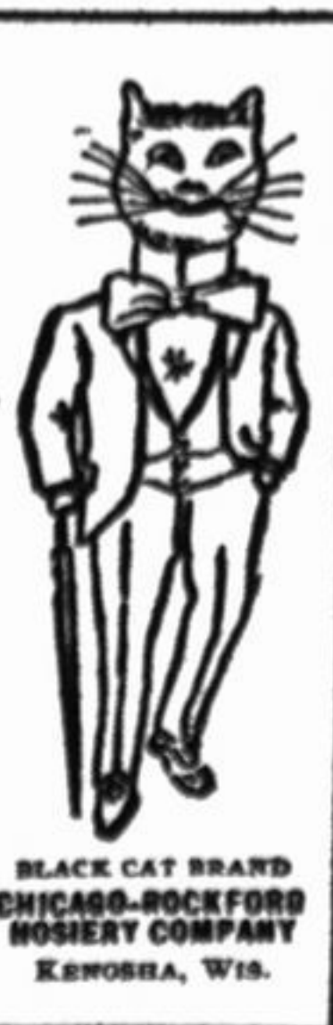
BLACK CAT BRAND CHICAGO-ROCKFORD HOSIERY COMPANY KEWONA, WIS.

Will wear out no matter how good, but some Hosiery will wear out a lot sooner than