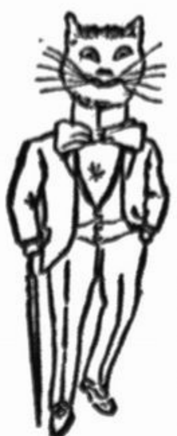
BLACK CAT BRAND CHICAGO-WICKFORD HOSIERY COMPANY KENOSHA, WIS.

Will wear out no matter how good, but some Hosiery will wear out a lot sooner than