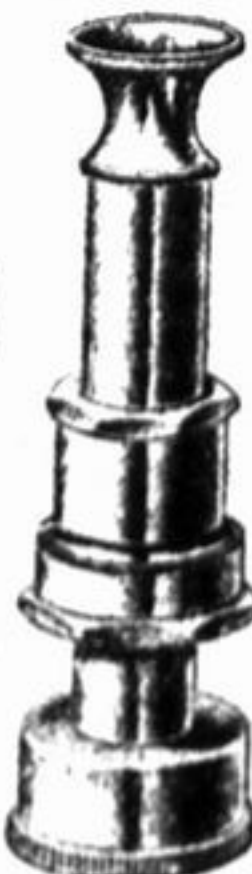
A COMBINATION NOZZLE

Get your paint of us. We will figure your work, furnish a painter and guarantee the material and work. We have the painter and can get your job done quickly.