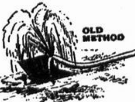
THIS WILL STOP THAT TROUBLE.

Saves the annoyance of Hose breaking at the ground connection. 35 cents.