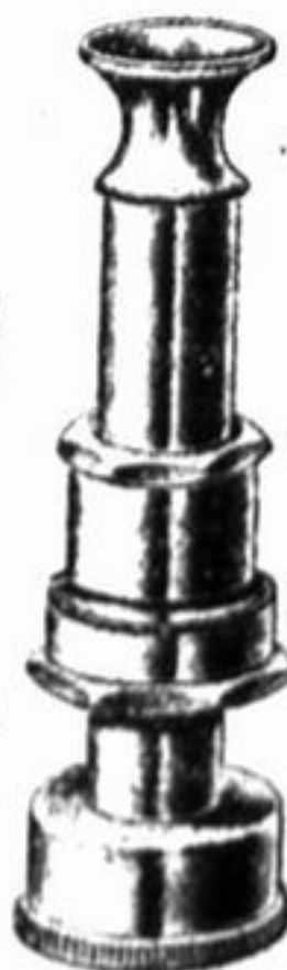
A COMBINATION NOZZLE

Get your paint of us. We will figure your work, furnish a painter and guarantee the material and work. We have the painter and can get your job done quickly.