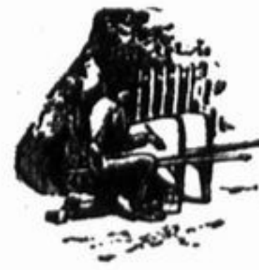
THE SHERWIN-WILLIAMS PAINTS