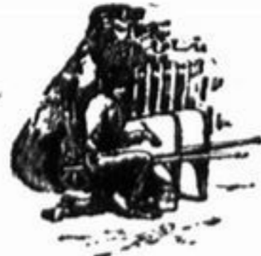
THE SHERWIN-WILLIAMS PAINTS