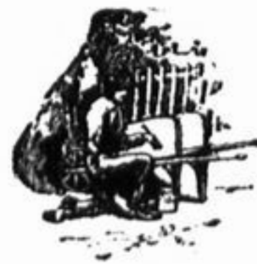
THE SHERWIN-WILLIAMS PAINTS