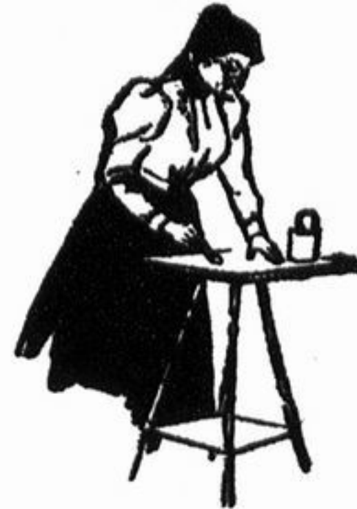
THE SHERWIN-WILLIAMS PAINTS

That we keep as complete a line of goods in our line as can be had anywhere.