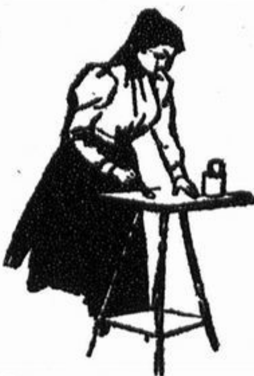
THE SHERWIN-WILLIAMS PAINTS

That we keep as complete a line of goods in our line as can be had anywhere.