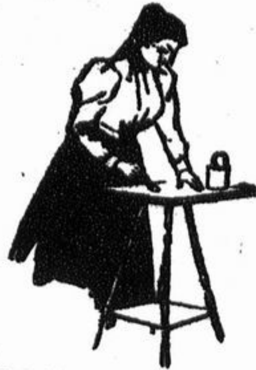
THE SHERWIN-WILLIAMS PAINTS.

That we keep as complete a line of goods in our line as can be had anywhere.