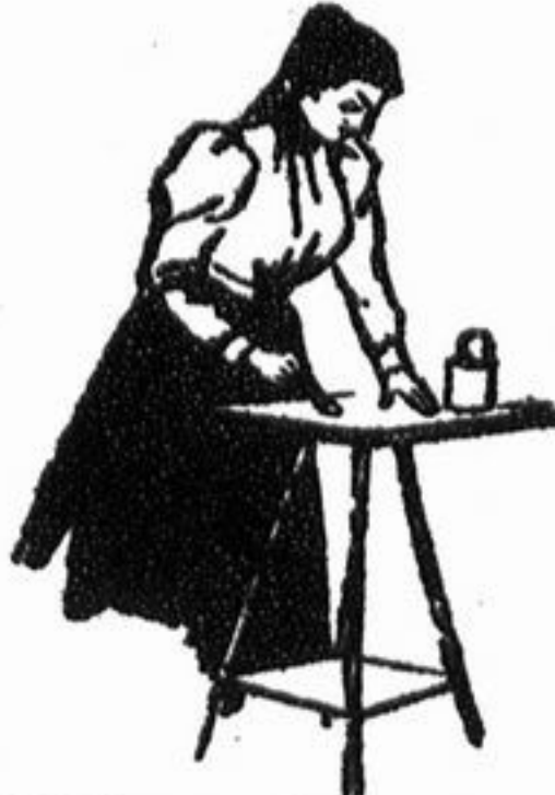
THE SHERWIN-WILLIAMS PAINTS

That we keep as complete a line of goods in our line as can be had anywhere.