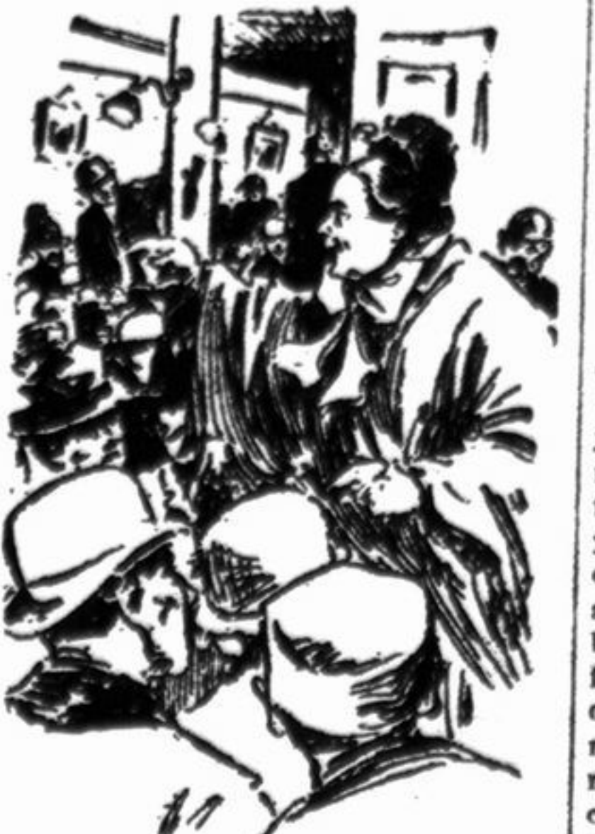
MRS. NATION ADDRESSES CROWD IN CHICAGO CITY HALL.