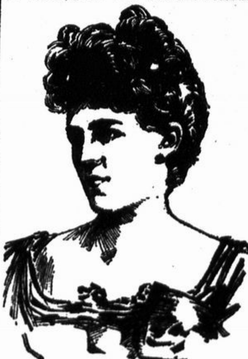
NELLIE GRANT SARTORIS. Nichols, a wealthy young resident of New York, popular among the younger social and exclusive set.