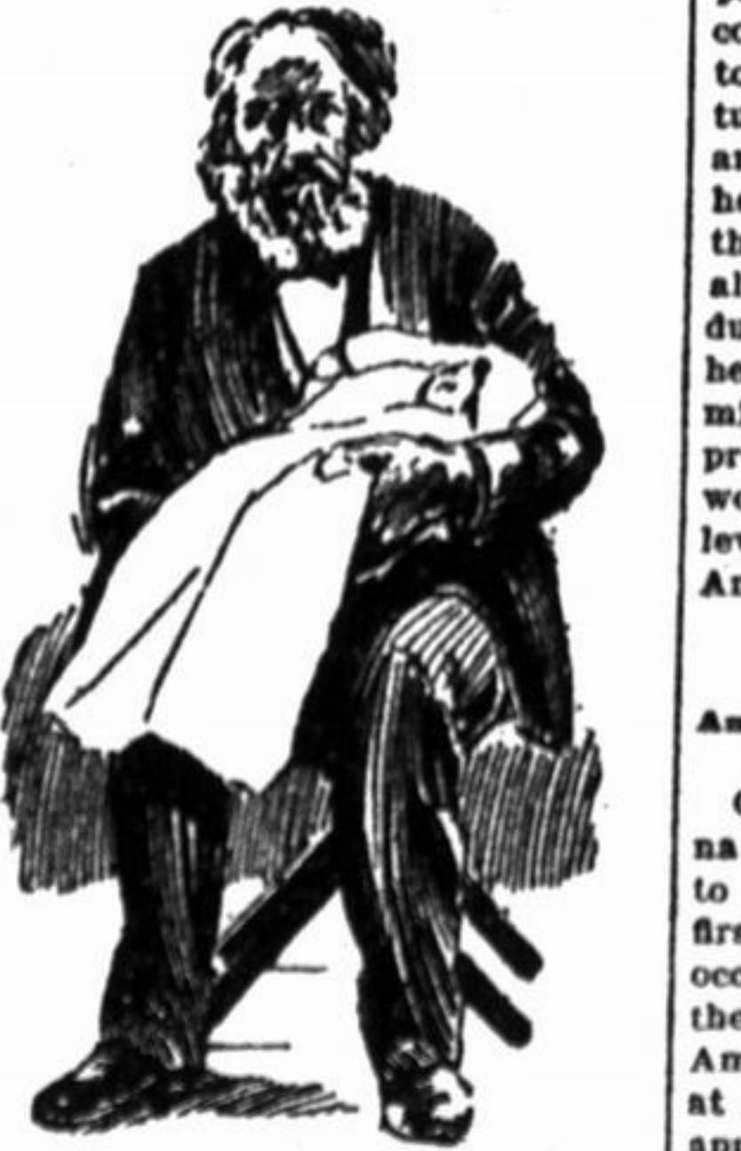
EDWARD EVERETT HALE NURSING A SICK BABY ON THE FLOATING HOSPITAL.

Although now in his 78th year Dr. Hale is still actively engaged in all sorts of charitable enterprises, and he is ready to speak at any time or in any place for suffering humanity.