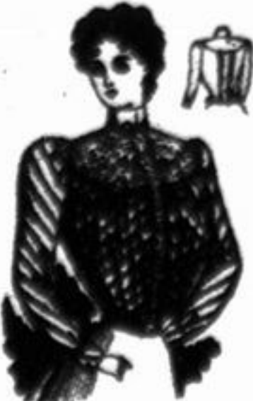
1917 - LADIES' SHIRT WAIST. SIZES 32, 34, 36, 38, 40, 42.