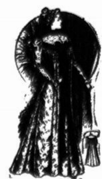
1872—LADIES' HOUSE GOWN. Sizes 22, 24, 26, 28, 30, 32.

We have some decided wrapper bargains made in the latest spring style perfect fitting from ..... 98cup