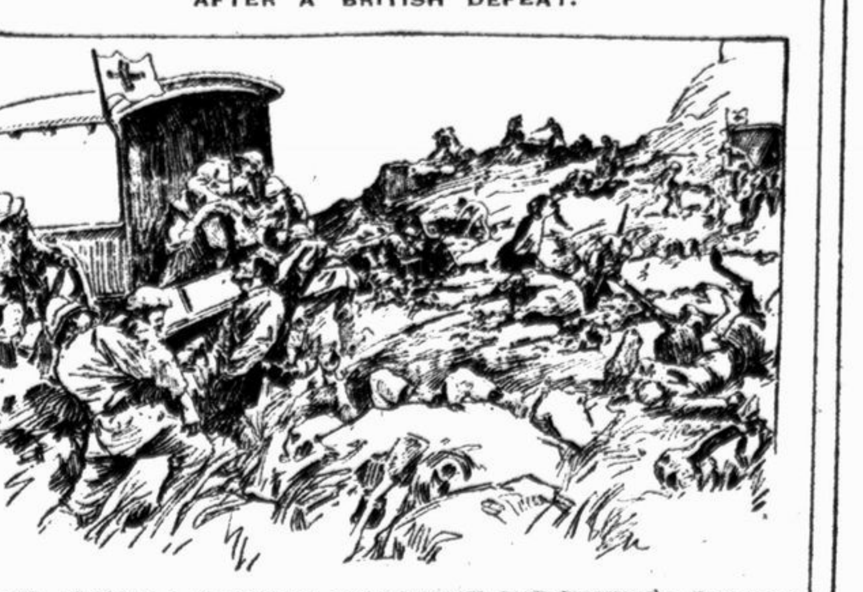
FIGHT AROUND LADYSMITH—COLLECTING THE WOUNDED ENGLISH SOLDIERS AT THE CLOSE OF THE DAY.