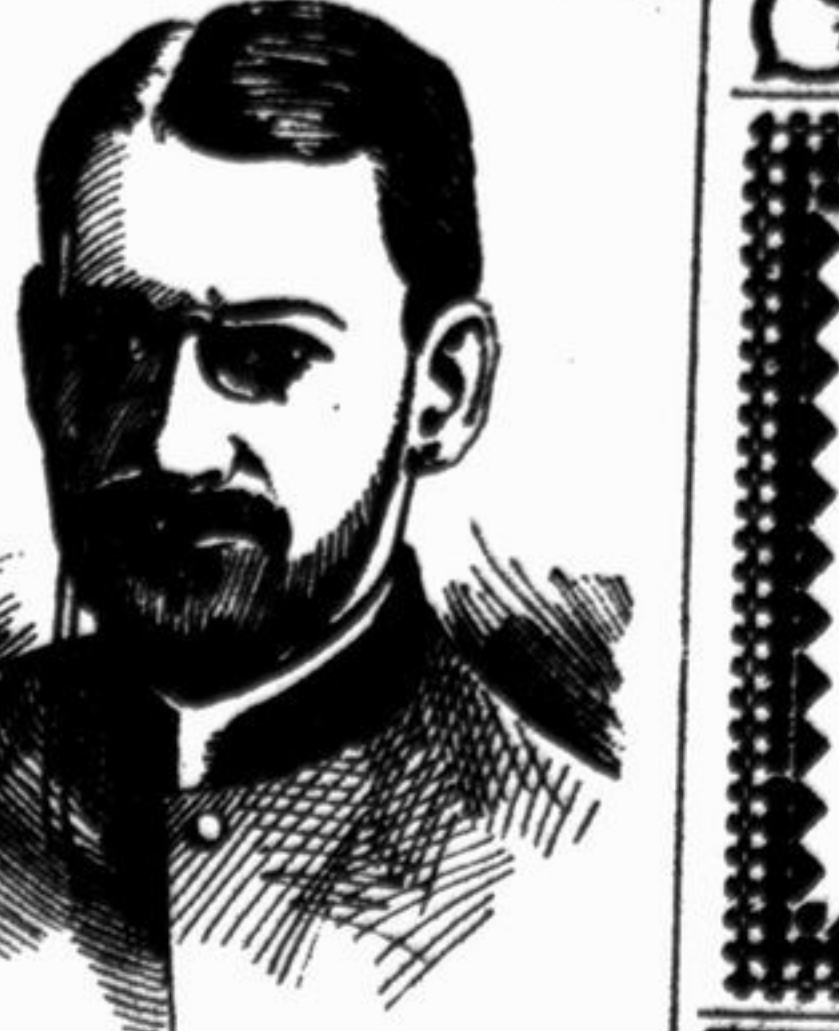
REV. HUGH PRICE HUGHES, product of modern social conditions acting upon the religious elements in man.