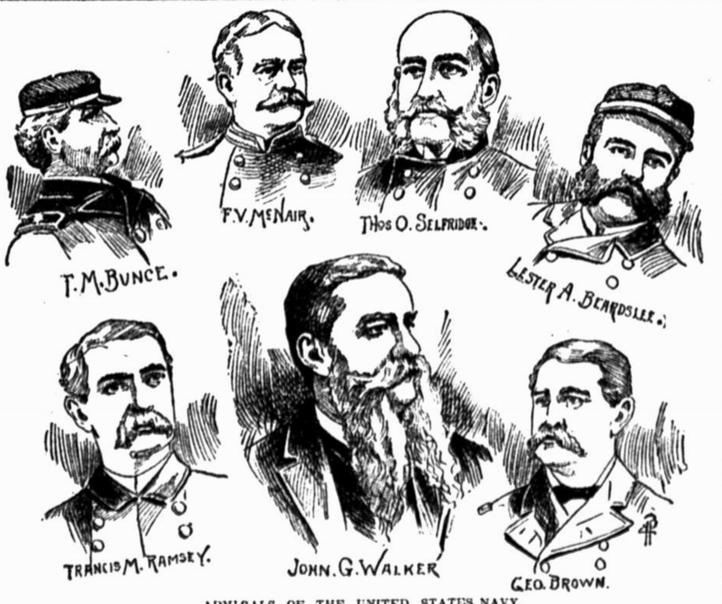
ADMIRALS OF THE UNITED STATES NAVY.

Coal Dust. Coal dust is successfully used as fuel for boilers by a process invented by a German named Wegener. It is fed to the furnace automatically, and only ordinary chimney draft is needed.