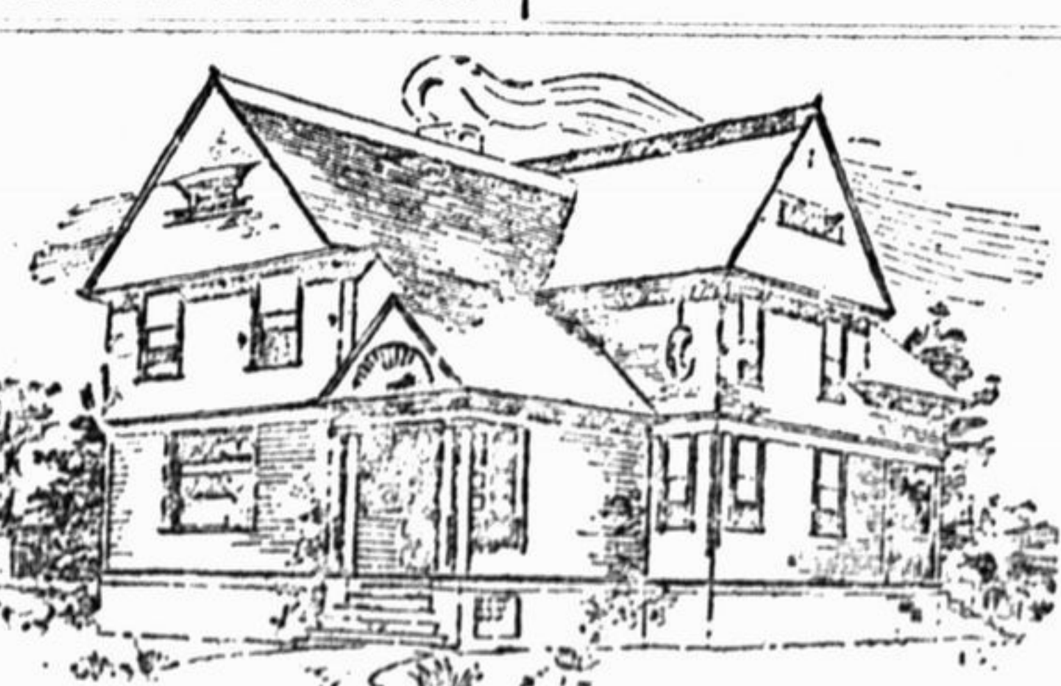
DESIGN FOR A MODERN FRAME DWELLING.

The accompanying illustration shows a tasteful and convenient country or city home. The cost to build will not exceed $1,800.