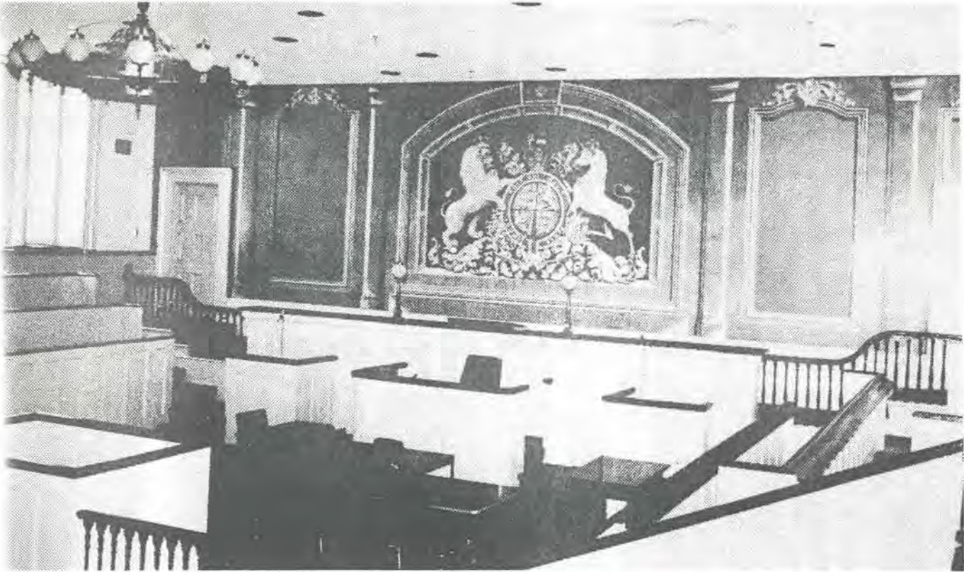
Beautifully restored sunken courtroom is patterned after Old Bailey in London, England