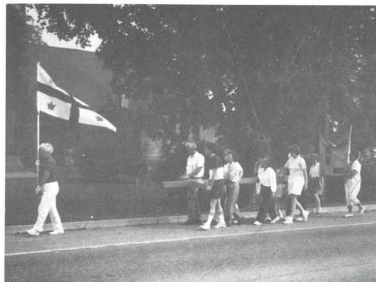
Parishioners carrying the Sesquicentennial Cross for the Diocese of Toronto 150th Anniversary September 1989