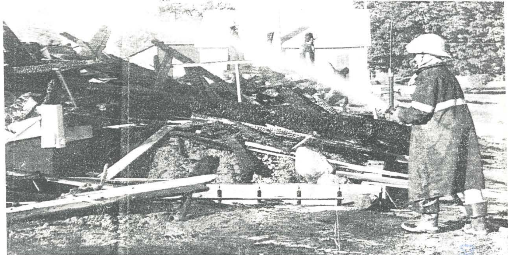
Making sure — A Colborne fire department firefighter pours water onto the smoldering ruins of the Wicklow Baptist Church on Friday evening to make sure flames don't start up again. The 162-year-old church, located just east of Grafton on Highway 2, was

vacant at the time of the fire. The cause of the fire is not known. In the photo below, the church is seen as it was being renovated last year.