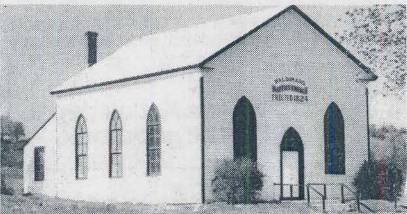
FIRST BAPTIST CHURCH -- Haldimand Baptist Church (1824) is the oldest surviving Baptist Church in Ontario. The congregation began in 1798 when Cramahe and Haldimand Baptists united. Progress was interrupted by the War of 1812. But in 1817, Haldimand Baptists established their own congregation and built this building. It stands on highway 2 near Wicklow. Services are at 7:30 p.m. July 3, 10, 17. The 185th anniversary is at 3 p.m. July 24.