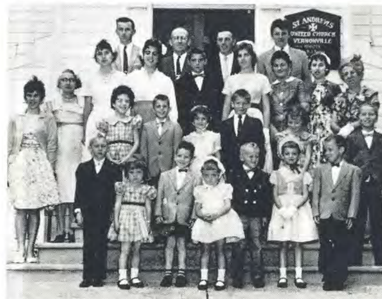
Sunday School of St. Andrew's United Church, Vernonville