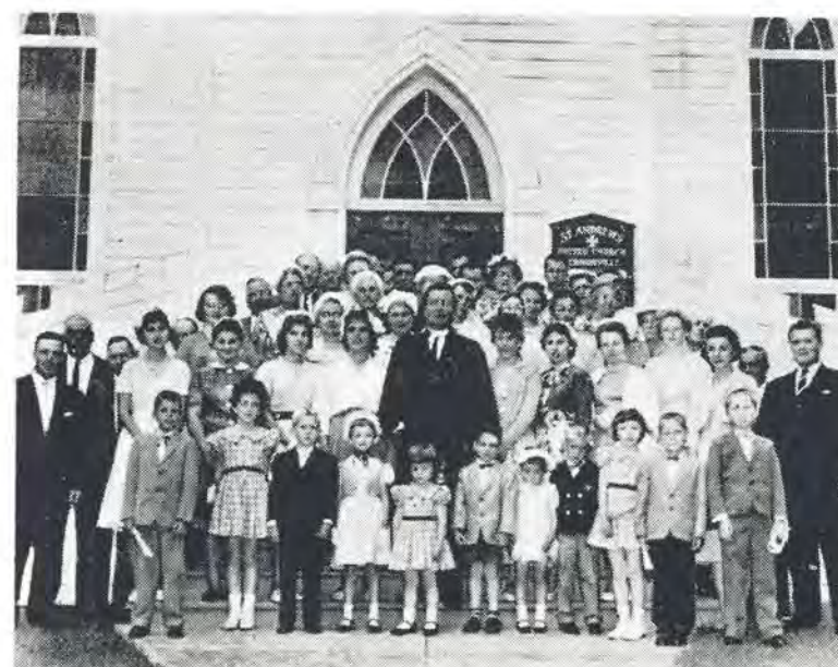
Congregation of St. Andrew's United Church, Vernonville