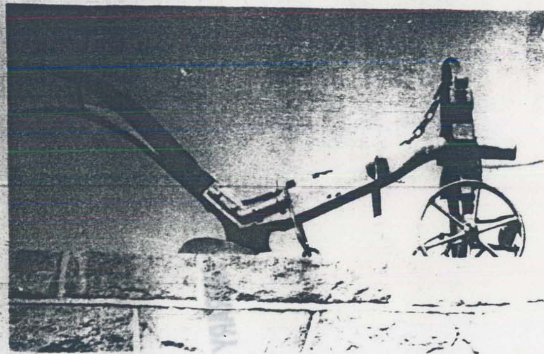
Here's the miniature of the "Norfolk" plough of Cobourg.