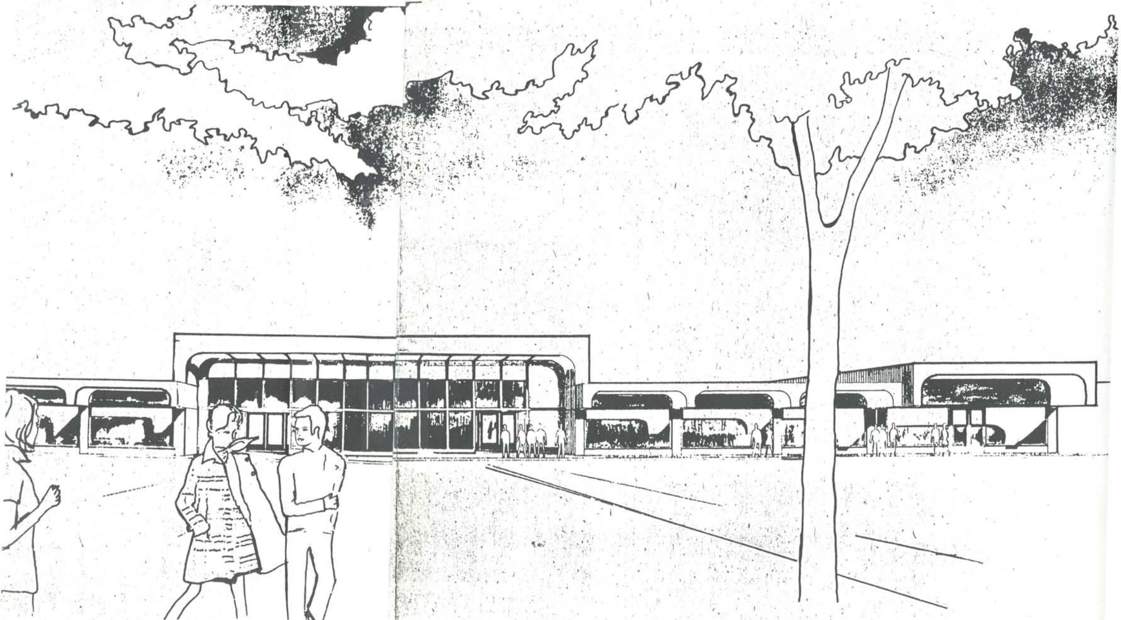
THIS IS ARTIST'S PERSPECTIVE FROM NORTH SIDE PARKING LOT. ENCLOSED MALL IS AT CENTRE, BUILT TO MATCH COUNTY FAIR